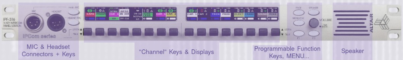
MIC & Headset Connectors + Keys