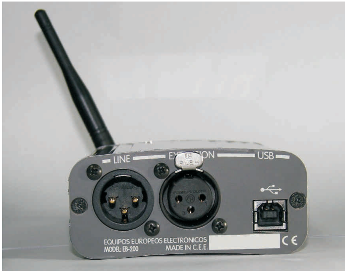
EB-200 Rear Panel